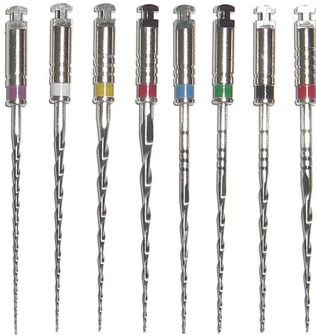
Figure 1. Mtwo Ni-Ti rotary instruments (10/0.04, 15/0.05, 20/0.06, 25/0.06, 30/0.05, 35/0.04, 40/0.04, and 25/0.07).

curvature (25–44 degrees) instrumented with Mtwo system; group 45-76GP (glide path), 10 roots with severe curvature (45–76 degrees) instrumented with a manual glide path followed by Mtwo system; and group 45-76NGP (no glide path), 10 roots with severe curvature (45–76 degrees) instrumented with Mtwo system.